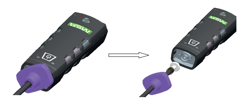
Fig. 3 Replacing Probe Filter