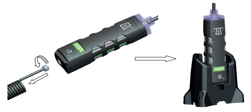
Fig. 2 Charging Device in Charing Cradle